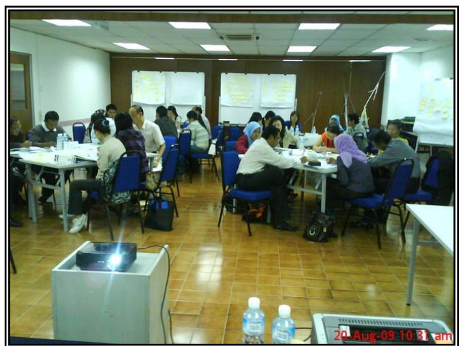
ISM.ISO participants seating in groups during Value Management session.